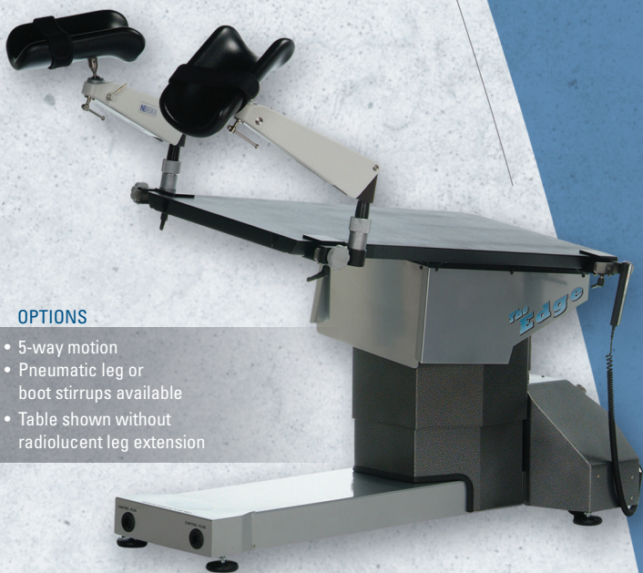
Image Guided Procedural Table