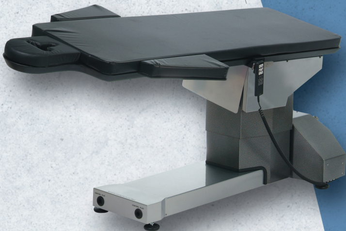
Image Guided Procedural Table

Unique central locking caster system allows table to set on four 3" diameter swivel feet for unsurpassed stability.